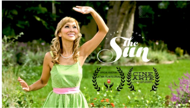
“The Sun” - https://www.youtube.com/watch?v=tc44QJ2uULA