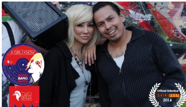
“Bang Bang Bang” - https://www.youtube.com/watch?v=oFEqURBRHI